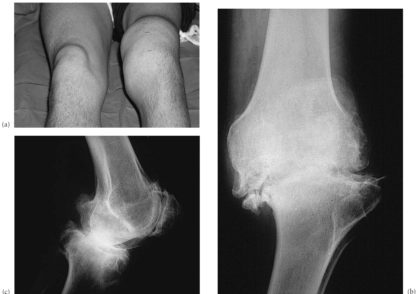
Fig. 1.2 Total knee arthroplasty for severe haemophilic arthropathy of the left knee of a 20-year-old patient. Arthropathy developed after 20 years of uncontrolled haemophilic synovitis: (a) clinical view of the synovitis; (b) Anteroposterior (AP) preoperative radiograph at the age of 40; (c) lateral preoperative view;

Although there are a number of prosthetic models (cemented and cementless), the most commonly used is Charnley's cemented low-friction arthroplasty. The indications for a total hip arthroplasty are intense groin pain (sometimes irradiating