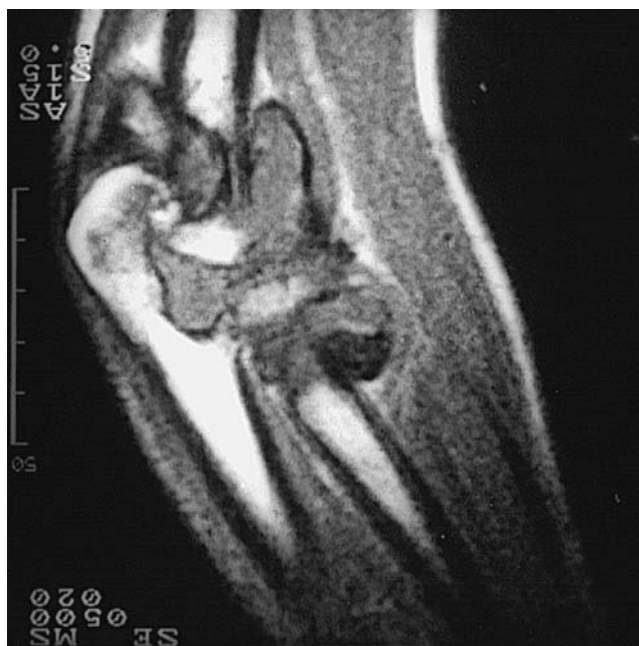
Fig. 1.1 Magnetic resonance imaging (MRI) scan of an elbow showing a severe degree of chronic haemophilic synovitis.

Bone hypertrophy may lead to leg length discrepancies, angular deformities and alterations of contour in the developing skeleton.