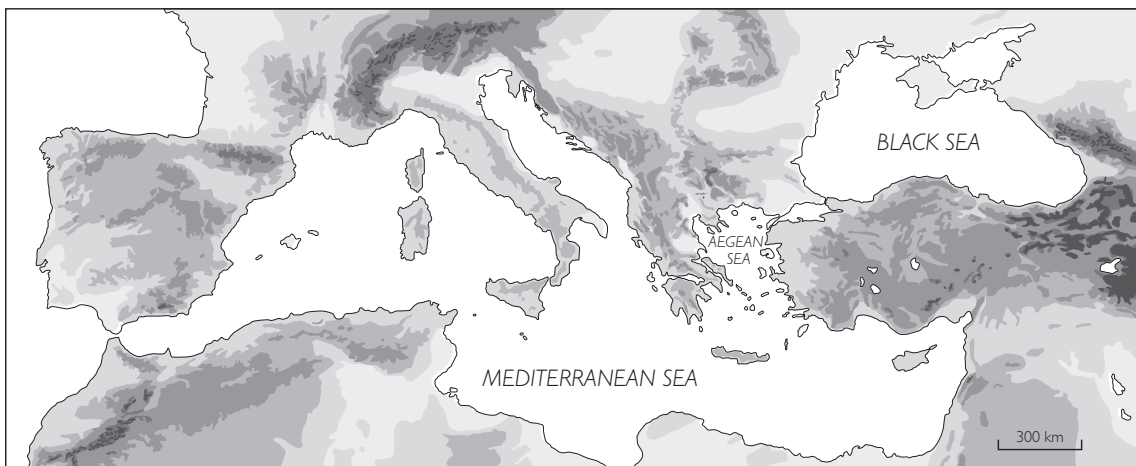
Map 2 Physical map of the Mediterranean region.

The most notable feature of the Greek landscape is the degree to which it is fragmented. The mainland is broken up by a series of mountain ridges that divide much of Greece into a number of relatively small pockets of habitable territory. And the islands, of which there are dozens in the Aegean Sea and a few more in the Ionian Sea to the west of mainland Greece, are merely a continuation of this series of ridges, so that, in geological terms, the only difference between the mainland and