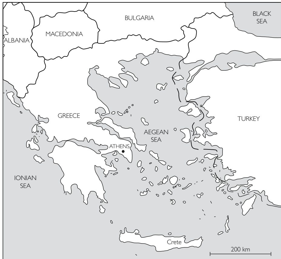
Map 1 Modern Greece and its neighbors.

Surprisingly, orienting ourselves in space is less straightforward than orienting ourselves chronologically. For, as it happens, it is easier to mark off the even flow of time into uniform segments than to draw stable boundaries on the seemingly solid surface of the earth. Today, Greece is a nation with more or less fixed borders and a secure place on the map (map 1). That has not always been the case. Indeed, the modern nation of Greece dates only from AD 1829, when the Greeks secured independence, following a lengthy insurgency, from the Ottoman Empire. At that time, however, the nation’s borders were not identical with those of modern-day Greece, which are a product of the tumultuous history of the twentieth century. (To provide a sense of scale, let us note that, in area, the modern country of Greece is almost