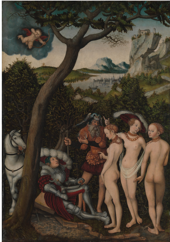
Figure 1 Lucas Cranach the Elder (1472–1553), The Judgment of Paris , oil on wood; 102 × 71 cm, ca. 1528. Source: The Metropolitan Museum of Art, Rogers Fund, 1928. www.metmuseum.org (accessed March 29, 2016).

is to be awarded by the Trojan prince Paris (also known as Alexander) to the lucky winner. The setting of this encounter, according to the myth, is Mount Ida, in what is now northwestern Turkey. The landscape depicted in Cranach's painting, however, is conspicuously northern European and, indeed, is virtually the same as the landscape that appears in some of Cranach's portraits of his German contemporaries. Further, Paris is wearing medieval armor, rather than anything resembling what an ancient Greek would actually have worn, and the goddesses Hera and Athena are shown in the nude, as they never would have been shown in ancient Greek art (figure 2). In short, despite the fact that Cranach's painting purports to provide a pictorial representation of ancient Greek myth, the terms in which the myth is portrayed are recognizably those of sixteenth-century Germany.