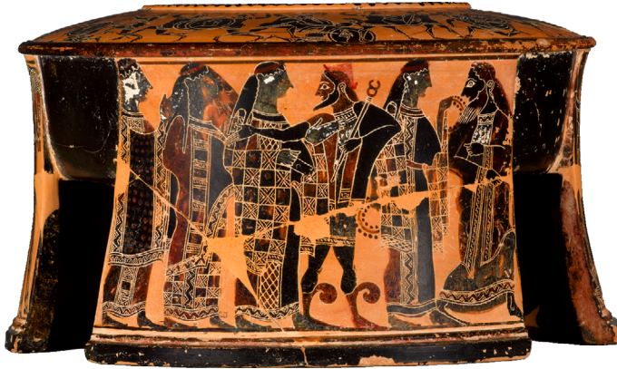
Figure 2 Attic black-figure tripod-jar showing Hermes (center) leading Athena, Hera, and Aphrodite to Paris (right) for judgment; height 14 cm, ca. 570 bc. Paris, Musée du Louvre, CA 616 C.

(although they were, of course, thought to exist) and with human beings who may or may not have existed and who may or may not have done what the story represents them as having done. Still, stories can tell us a great deal about the people among whom the stories circulate. Surely there is an authentic (or at least a more authentic) version of the story of the judgment of Paris which, if we can reconstruct it, will help us recover something of ancient Greek civilization? In any case, the ancient Greeks have a history . Can we not discover at least some “facts” about the ancient Greeks, or at least about some of the ancient Greeks?